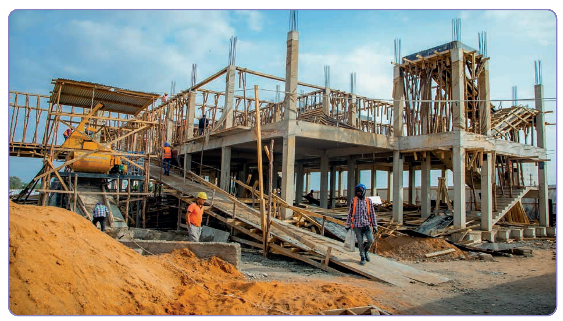
Construction of PPRA Head Office in Dodoma, as captured on December 12, 2022